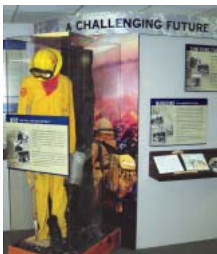
An exhibit in the Cuyamaca Visitor Center, donated by CRSPIA to temporarily replace the Dyar House Museum that burned in the 2003 Cedar Fire.

So that the children and citizens of Southern California can continue to enjoy mountain adventure and wilderness experience, CRSPIA needs your help.